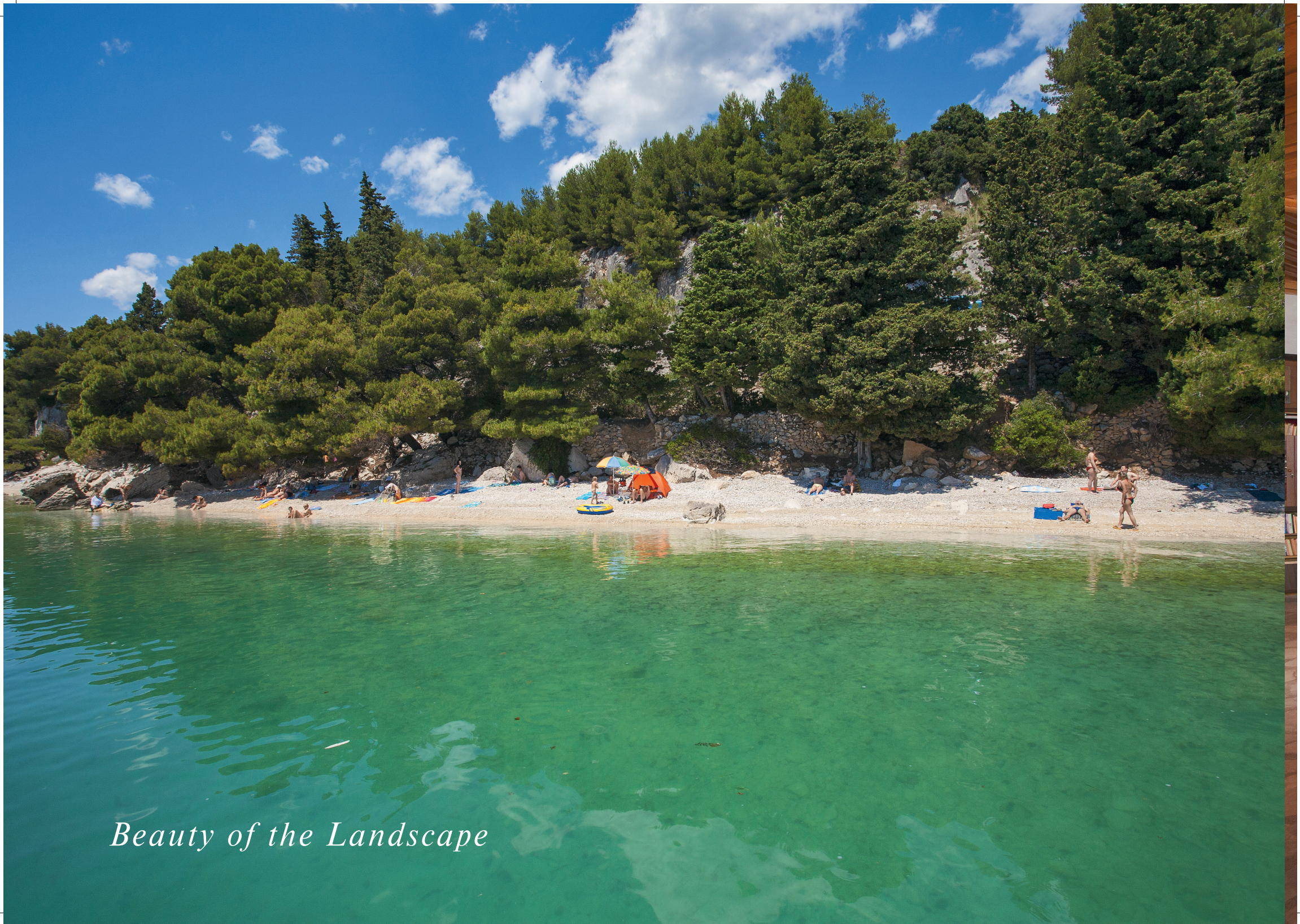
Beauty of the Landscape