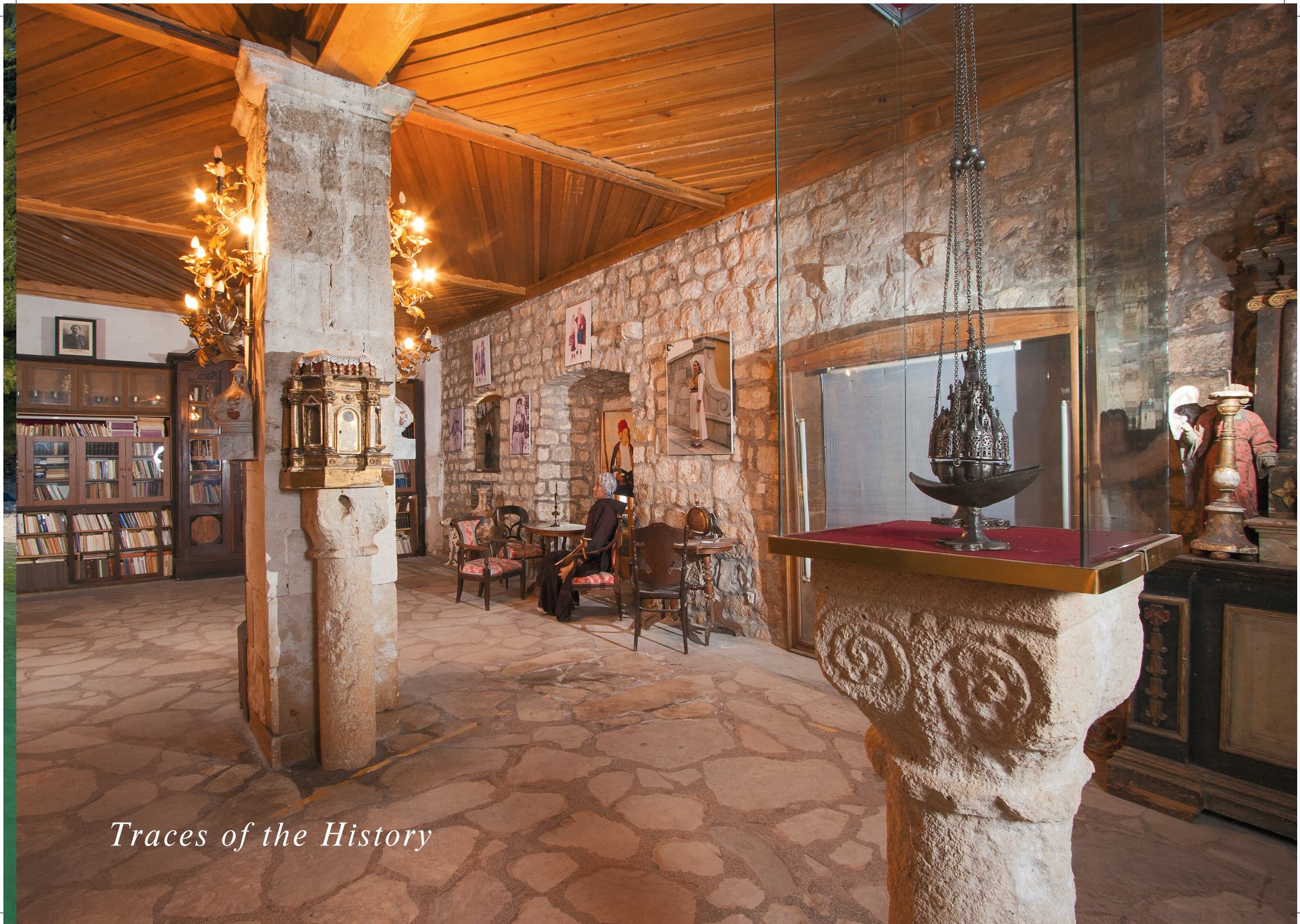
Traces of the History